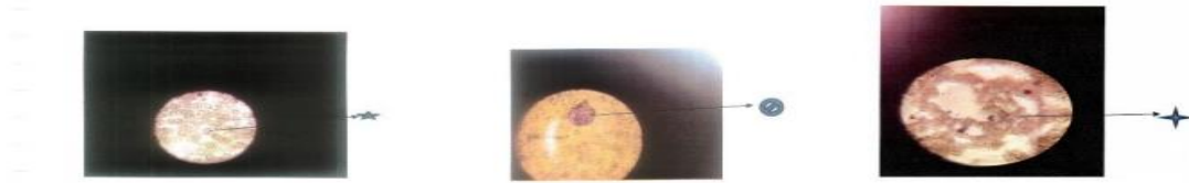
Plate 1: Trophozoite of Plasmodium malariae Plate 2: Gametocytes of Plasmodium vivax Plate 3: Trophozoite of Plasmodium ovale

Plates 1,2,3 are also pictures showing how various specie look under the microscope.